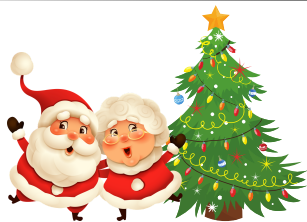
2023 Holiday Tree Lighting Event

DECEMBER 2023 | WWW.KINGSFORDMI.GOV | 906-774-3526