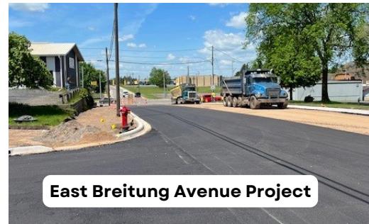
East Breitung Avenue Project