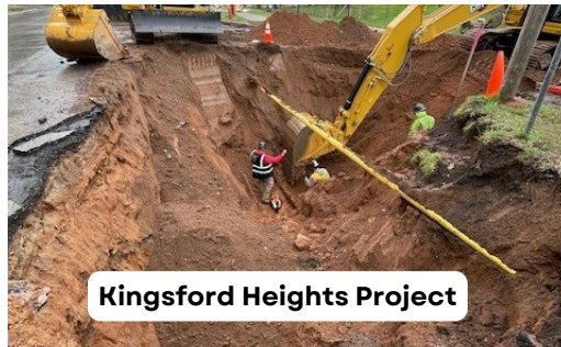
Kingsford Heights Project