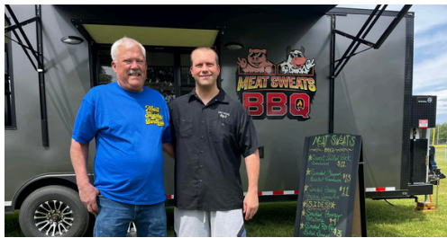
MEAT SWEATS BBQ FOOD TRUCK FROM 2024 EVENT

Click here for the Rummage Sale Registration Form!