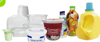
Clean Plastic Containers (bottles, tubs, jugs and jars)