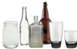
Glass (empty bottles and jars)