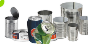
Clean and Empty Metal Containers (all cans)