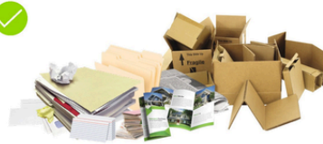
Paper (paper, cartons and cardboard)